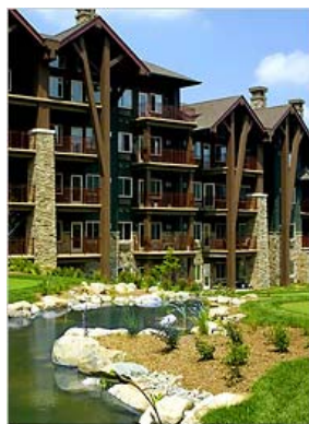
Crystal Springs Resort

WHAT Residential additions at a large resort.